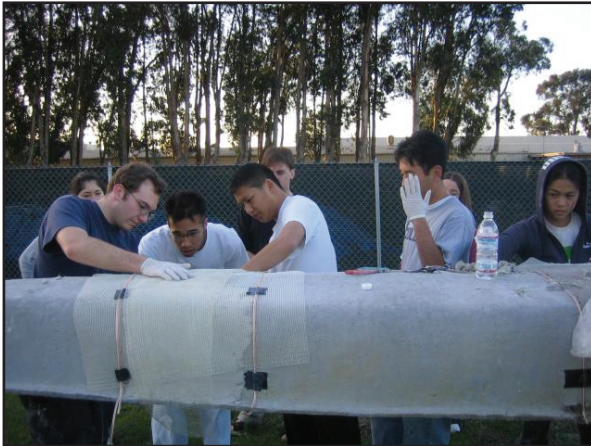
Team Members Attaching Float Rings to Concrete Canoe

The UC Berkeley ASCE Student Chapter will host the 2006 Mid-Pacific Regional Conference Concrete Canoe Races and Steel Bridge Competition on April 28-30, 2006. Eight canoe teams and bridge teams will square off to qualify for their respective national competitions. The competitions will take place at two locations; the Canoe Races will occur at Lake Merritt in downtown Oakland, and the Steel Bridge teams will be constructing their bridges on the Doe Library Terrace and the Memorial Glade on the Berkeley campus. The complete schedule for Mid-Pac can be found at www.midpac.calasce.org .