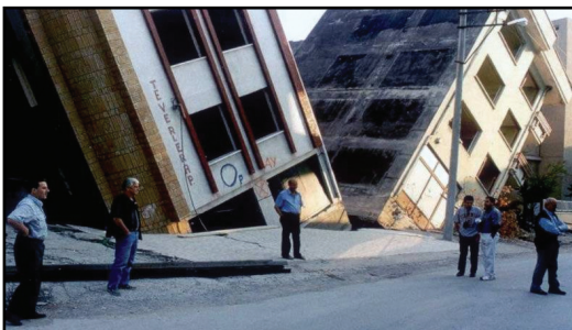
Foundation Failure due to Soil Liquefaction during the 1999 Kocaeli Earthquake, Turkey