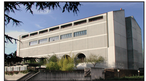
New South Elevation of Davis Hall

The 1930's north wing of Davis Hall was demolished in 2003 to make way for a new building for the Center for Information Technology Research in the Interest of Society (CITRIS). As a result, the main Davis Hall building needed to be reconfigured to accommodate the laboratories and other facilities from the north wing. This gave us a rare opportunity to renovate and upgrade office space for students and faculty, and provide laboratory space for wet chemistry, optical and electron microscopes, environmental chambers for concrete and geotechnical materials, and an instructional earthquake shake table. A new computer laboratory and instructional facility was also added, and classrooms throughout the building were modernized with the latest audio/visual technology. A completely new gigabit computer network was installed and a wireless network is now available in all classrooms and public areas. A state-of-the-art conference room will be completed this summer.