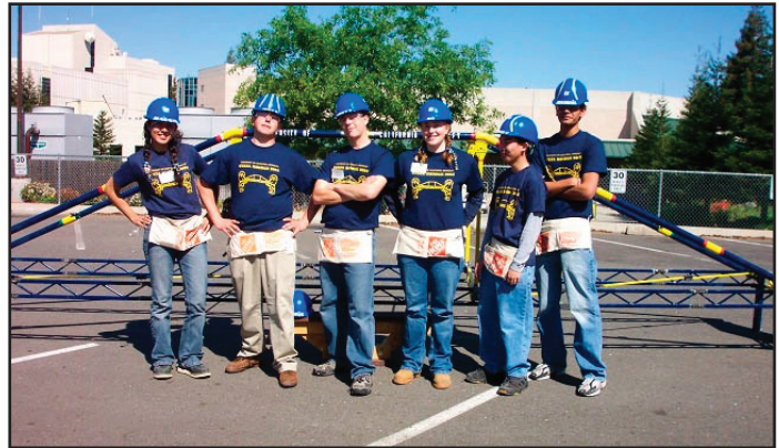
Steel Bridge Team with 2005 Entry

The National Concrete Canoe Competition has a long history, dating back to 1972 when concrete canoes were first constructed at UC Berkeley and the University of Illinois. Last year Berkeley won fourth place, continuing its reign as one of the premier teams in the nation.